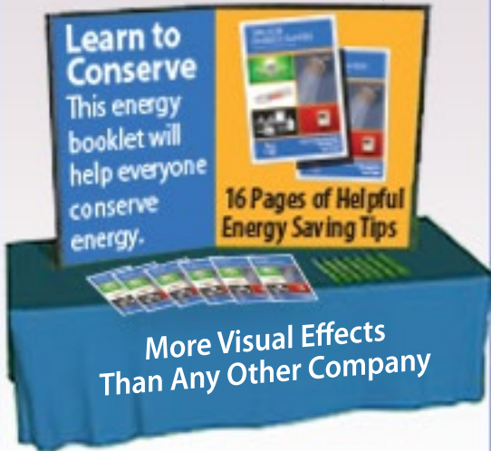
Table Top Displays

More Visual Effects Than Any Other Company Promote your message with a display in your lobby, cafeteria or conference room.